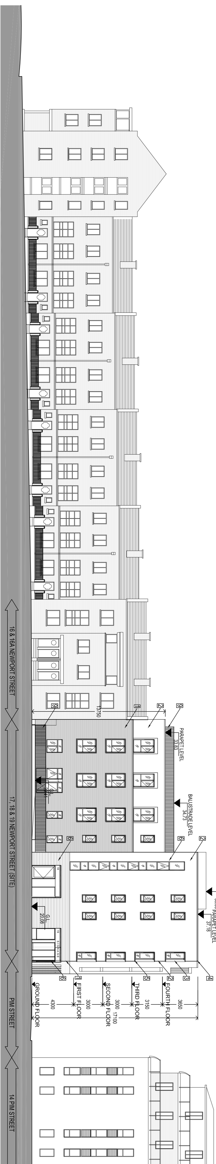
04 PROPOSED CONTEXTUAL NORTH ELEVATION (NEWPORT STREET) SCALE 1:200